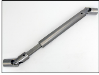
TU Type Un-hardened Pins